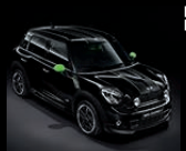
MINI RAY package in Alien Green 1