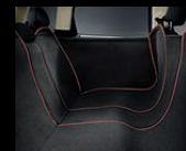
Protective rear cover