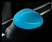
Exterior mirror caps in Shocking Blue 2