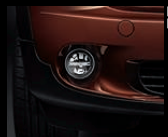
LED daytime running light