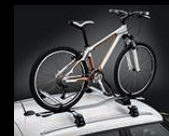
Touring cycle holder, lockable