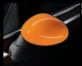
Exterior mirror caps in Vitamin Orange 2