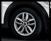
Double Spoke R124 in Silver, size 7J x 17 inches, winter tyre