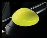
Exterior mirror caps in Lemon Yellow 2