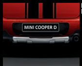
Off-road styling package