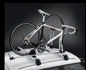
Racing cycle holder, lockable