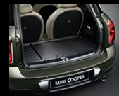
Luggage compartment mat, fitted