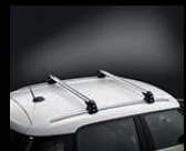
Roof rack base support system for roof rails, lockable