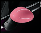
Exterior mirror caps in Energy Pink 2