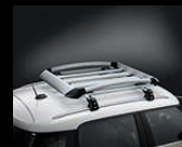
Luggage rack, lockable