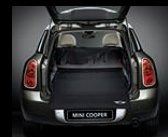
Protective bootspace cover