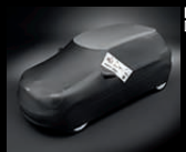
Indoor/outdoor car cover