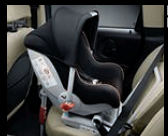
MINI baby seat 0+