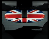
Rear-view mirror housing with Union Jack design