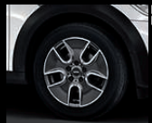
Tunnel Spoke R125 in Anthracite, size 7J x 17 inches