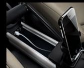
Universal holder for mobile devices