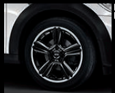
5-Star Double Spoke Composite R127 in Black, size 7.5J x 18 inches