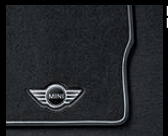
Textile floor mats