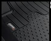
All-weather floor mats